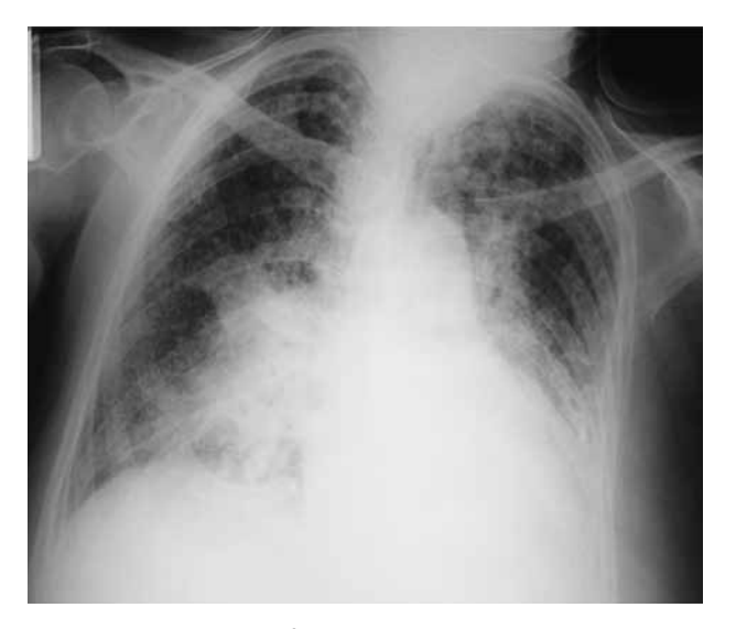
FIGURE 3. 78 year-old female with military tuberculosis and acute respiratory distress syndrome: Chest X ray at the time of deterioration.

(HAP), and even though the WBC was normal, the patient was administered levofloxacin and meropenem. Because of the CNS symptoms the patient underwent lumbar puncture and the cerebrospinal fluid (CSF) examination showed 20 cells/mm<sup>3</sup> with a lymphocytic predominance, glucose 42 mg/dl (blood glucose 133 mg/dl), and albumin 79 mg/dl. Although more cells, lower glucose levels and higher protein levels would be expected, these findings were regarded as compatible with tuberculous meningitis, since the patient was already under antitubercular treatment when the lumbar puncture was performed. Adenosine deaminase (ADA) testing was not available at that time. The CSF direct stain was positive for M. tuberculosis. With the conclusive diagnosis of tuberculous meningitis, treatment with dexamethasone (12 mg daily) was initiated, but the patient's condition remained critical and she died two days later from respiratory insufficiency. After death, RNA molecular analyses for M. tuberculosis