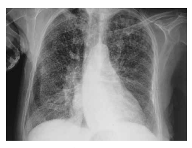
FIGURE 1. 78 year-old female with military tuberculosis: Chest X ray on admission.

The main clinical and laboratory findings were: bilateral mild decrease in the breath sounds, systolic murmur of the mitral valve, hypoxaemia (arterial blood gas pH: 7.38, pO<sub>2</sub>: 58.2 mmHg, pCO<sub>2</sub>: 28.9 mmHg, HCO<sub>3</sub>17 mmol/lt with oxygen supply of 2 lt/min), normochromic normocytic anaemia with Hb 11.5 g/dl and Ht 35.6%, mild leukocytosis, white blood cells (WBC): 11,700/mm<sup>3</sup>, polymorphonuclear leukocytes 93%, Lymphocytes 2%, monocytes 5.2%, hypoalbuminaemia (2.3 g/dl), hyponatraemia (128 mmol/l), erythrocyte sedimentation rate (ESR) 88 mm/1h, C reactive protein (CRP) 11 mg/dl and an increase in ACE (93.1 U/L with a normal range of 23-57 U/L). Screening